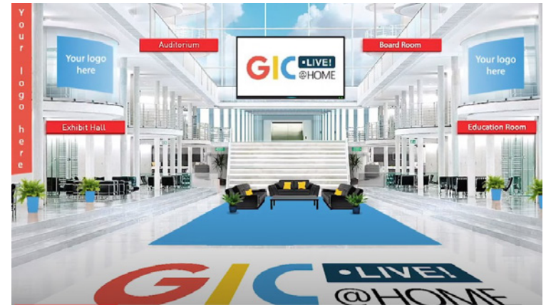
Example of Virtual Lobby

Full colour sponsor logo or kick plate on Help Desk - Click-able to your website or video